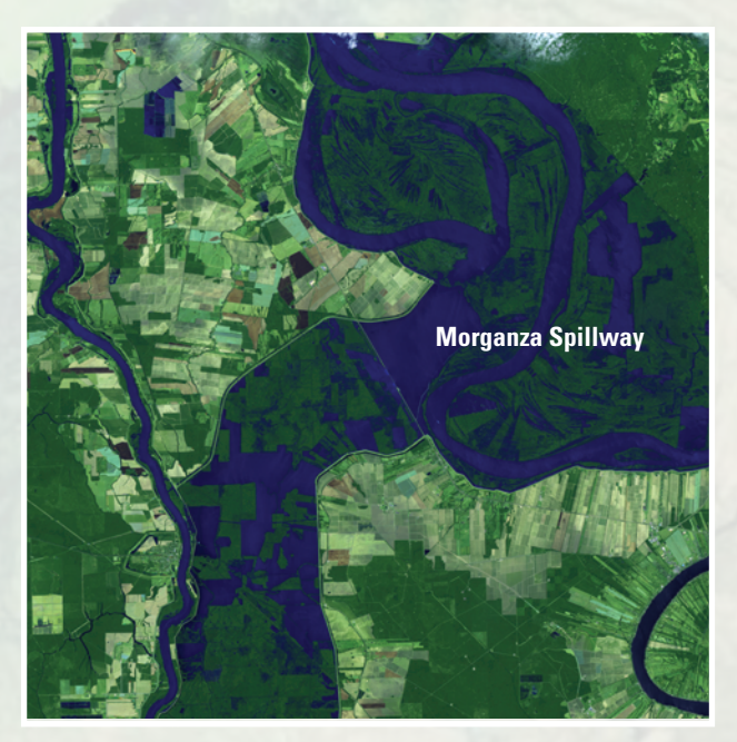
Landsat 7 Enhanced Thematic Mapper Plus (ETM+) image acquired May 18, 2011.

For more information on Landsat data products and to view additional images, visit http://landsat.usgs.gov.