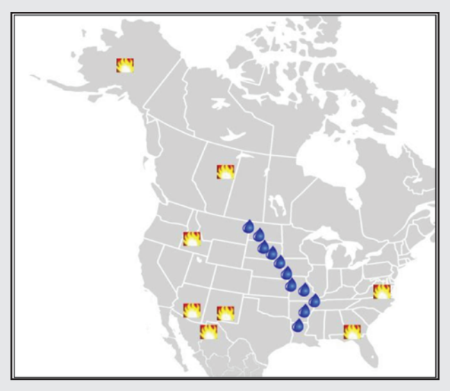
Summer 2011 fire and flooding activity (not all-inclusive).