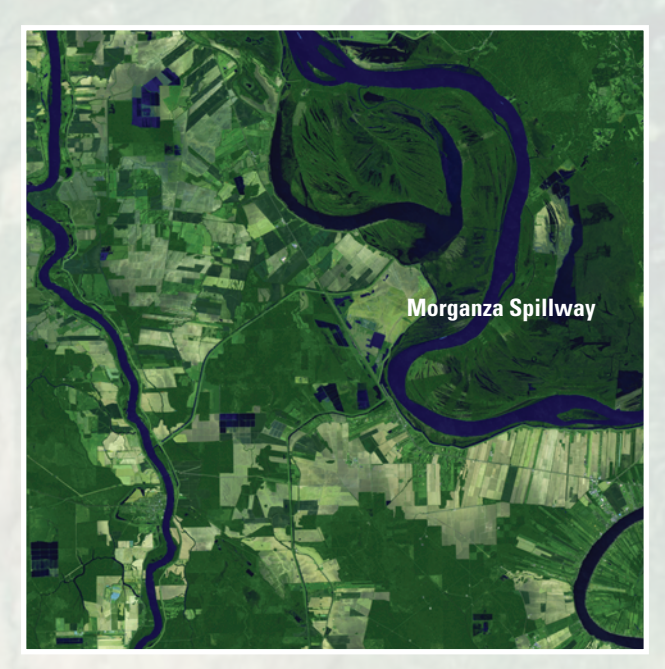
Landsat 7 Enhanced Thematic Mapper Plus (ETM+) image acquired April 16, 2011.

Heavy rain in the Mississippi River Valley prompted the opening of the Morganza Spillway in central Louisiana on May 14, 2011. Opening the spillway relieved pressure on levees protecting Baton Rouge and New Orleans downstream but flooded the local area.