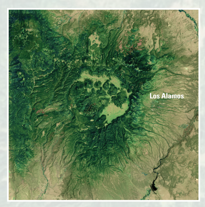
Landsat 5 Thematic Mapper (TM) image acquired June 24, 2011.

New Mexico's largest wildfire in recorded history began June 26, 2011, and threatened the town of Los Alamos and the Los Alamos National Laboratory. The fire was considered fully contained on August 3, 2011, only after damaging the Santa Fe National Forest.