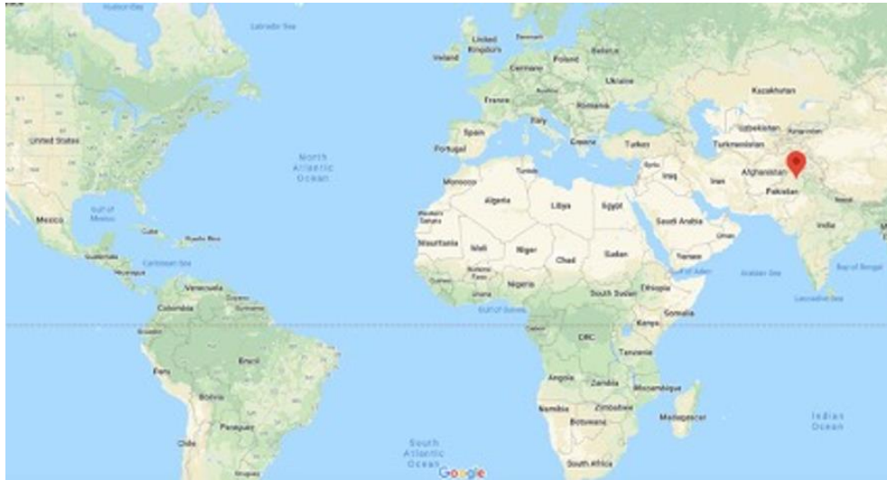
Figure 1: Developed using Google Maps

In Pakistan, agriculture is the largest sector of the economy, and all of Pakistan's people depend on farmers for their food. The main crops that are produced are wheat, sugarcane, rice, and maize. Of all the crops grown here, however, wheat is the biggest agricultural crop by far. The Sargodha region is known for being a major grain producer, and the main crop grown in this region is wheat. The season for growing wheat begins in February and runs through the beginning of August. As there is not always enough precipitation to water wheat crops throughout the growing season, wheat farmers will irrigate their wheat crops by flooding their fields with water.