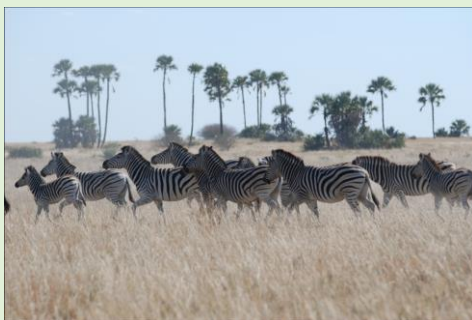
NASA precipitation data used to predict zebra migrations in Botswana.