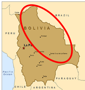
Map of Bolivia (above). Red circle denotes area that GPM data is used to identify endangered river basins.

The large-scale development of agriculture, mining, oil & gas, hydroelectric dams, timber and fisheries in the Amazon require robust environmental research, planning, and management of aquatic ecosystems. In response to these needs, the Wildlife Conservation Society (WCS) in Bolivia are using over 17 years of precipitation data (1998-2015) from NASA's TRMM and GPM mission to collect rainfall totals and estimate potential discharge rates throughout the Bolivian Amazon. This information will enable WCS Bolivia to identify endangered river basins, which will then provide decision makers a useful framework to implement a mitigation hierarchy approach. This set of guidelines is meant to help decision makers limit negative impacts on biodiversity from development projects such as dam implementation in Bolivia.