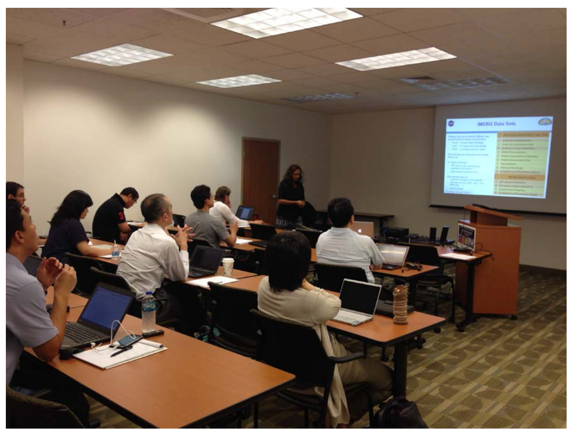
Day Three training held at ESSIC, University of Maryland, College Park. There were two, 4-hour sessions to review GPM data products, access and provide hands' on training